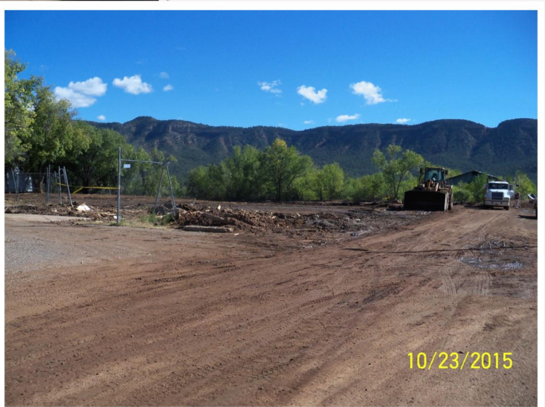
The area after the building was removed.