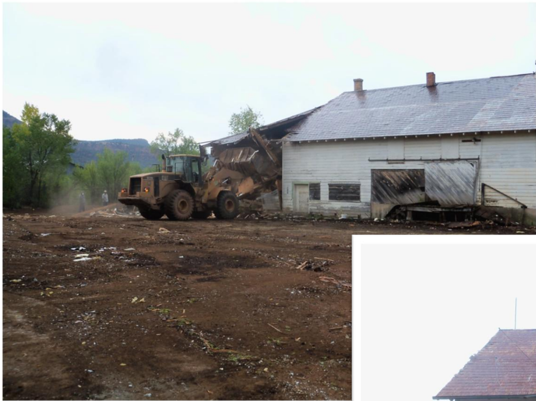
During demolish of building by Tribal Public Works Department.